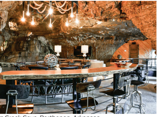
Beckham Creek Cave, Parthenon, Arkansas