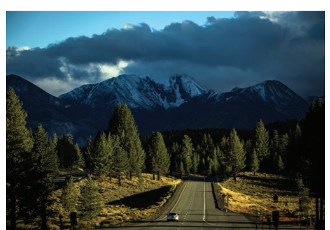
California's Sierra Nevadas offer nonstop stunning views.

A favorite of motorcyclists and sports car enthusiasts, the harrowing 123-mile Coronado Trail, aka Devil's Highway, ascends, narrows, dips, and twists through more than 400 switchbacks as it climbs from high desert floor to 9,000-foot alpine forest.