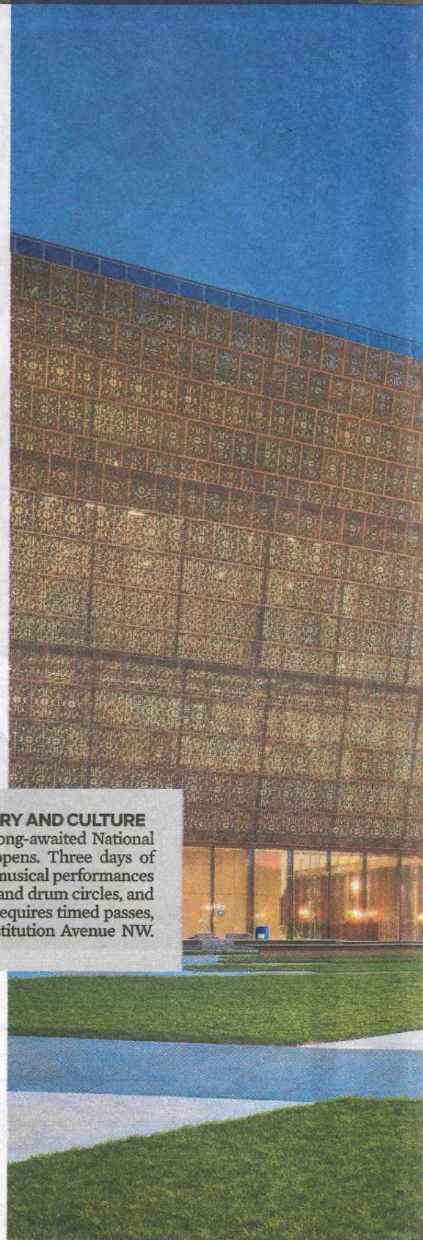
The National Museum of African-American History and Culture

Stephen King, Bob Woodward, Diane Rehm and Newt Gingrich are a few of about 120 authors, illustrators and poets making appearances and hosting presentations here. This will be the first bookfest under the new librarian of Congress, Carla Hayden, formerly of Baltimore's Enoch Pratt Free Library. Dozens of stages and pavilions offer programs, presentations and books dedicated to practically every genre of literature. 9 a.m.-10 p.m. Sept. 24. Washington Convention Center, 801 Mount Vernon Place NW. Free. 888-714-4696, loc.gov/bookfest