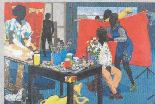
KERRY JAMES MARSHALL

Planners, designers, builders and preservation folks lead free tours and talks in places like the Arsenal, Carnegie Hall, Google's Chelsea offices, Roosevelt Island's Four Freedoms Park and Brooklyn Bridge Park. This weekend offers doors unlocked to otherwise-restricted, interiors and exteriors of NYC's most intriguing buildings and landmarks. Yes, it's maddening that the list of venues isn't complete until just before the event, but check the website for those requiring reservations. Oct. 15-16. ohny.org/weekend/overview